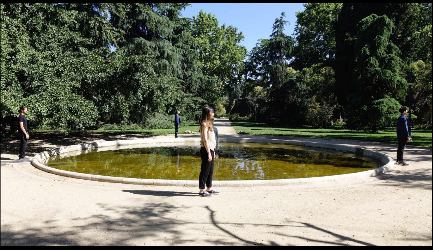
The Book of Silly Things & Nonsense (2018)

World première record. Published by Da_sh editions.